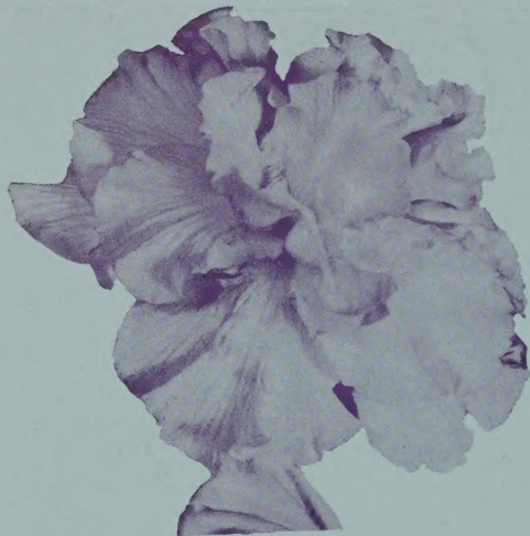
NEW DUPLEX FORMS TYPES AND COLORS

17 page culture booklet supplied with all tuber or seed orders.